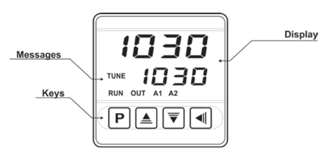
Fig. 02 - Identification of the parts referring to the front panel

The controller's front panel, with its parts, can be seen in the Fig. 02: